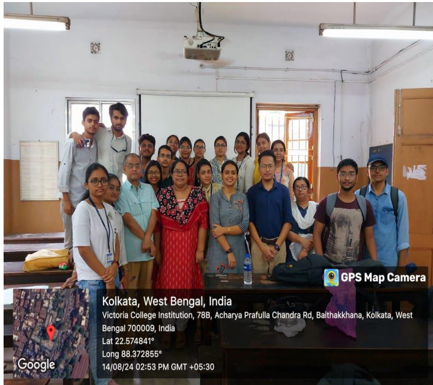
With the participants